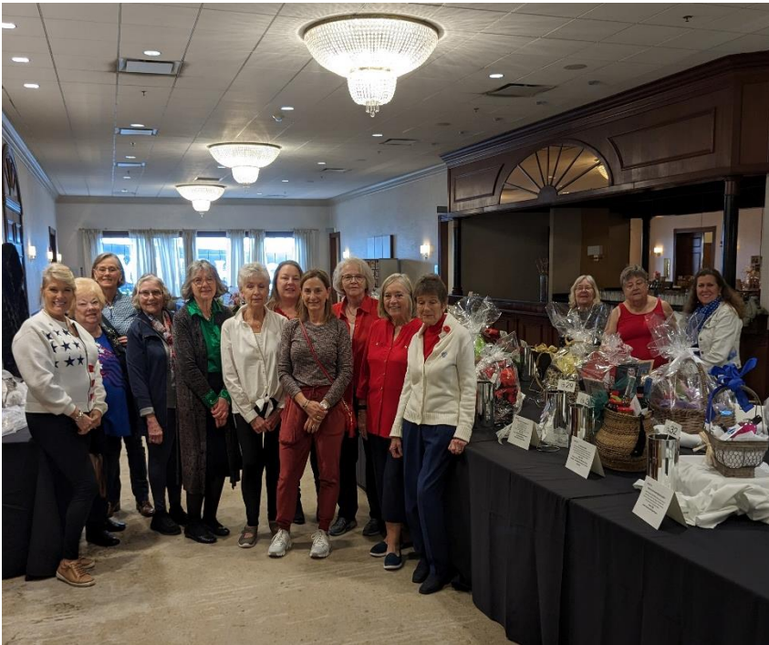
Pictured on the left, our volunteer members who prepared for the beautiful and memorable tribute to our Armed Forces. Pictured below are uniforms displayed from the Armed Forces.