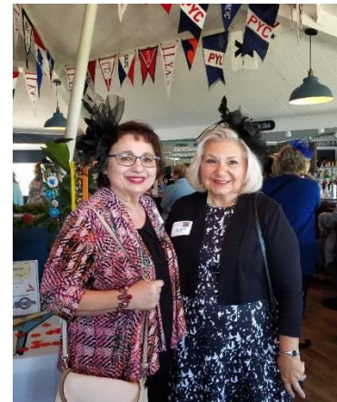
Pictured above are members and guests who attended the event. Besides all of the fun, 4 large bags of travel-size items such as toiletries, tissues, shampoo, and toothpaste were collected for 'Support the Troops Wisconsin, Inc.' with a representative speaking to us about the organization.